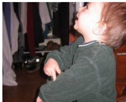
Aidan, age 13 months, signs "time" with Baby Signing Time.